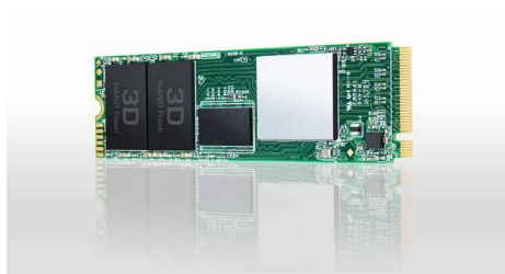
PCIe Gen3 x4 interface and NVMe standard

Transcend's MTE850 M.2 SSD utilizes the PCI Express® Gen3 x4 interface supported by the latest NVMe™ standard, to unleash next-generation performance. The MTE850 M.2 SSD aims at high-end applications, such as digital audio/video production, gaming, and enterprise use, which require constant processing heavy workloads with no system lags or slowdowns of any kind. Powered by 3D MLC NAND flash memory, the MTE850 M.2 SSD gives you not only fast transfer speeds but unmatched reliability.